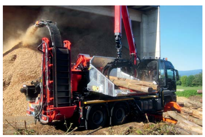
Wood chip discharge with blower