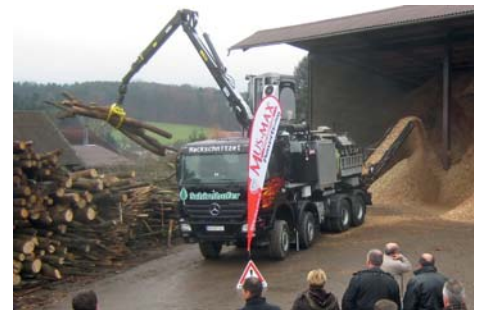
WT 11 DS set up on truck, with 500 HP diesel engine and discharge conveyor belt