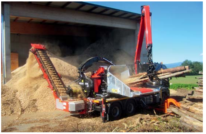
Wood chip discharge with conveyor belt

The biggest advantage of the truck is the driving speed of 80 km/h. The hack-truck is suitable for driving on motorways and lets you get to your customers as quickly as possible. That saves you time – and saving time again saves you money.