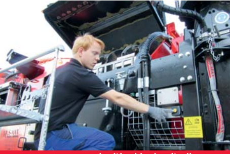
Top rotor cover – can be lifted hydraulically