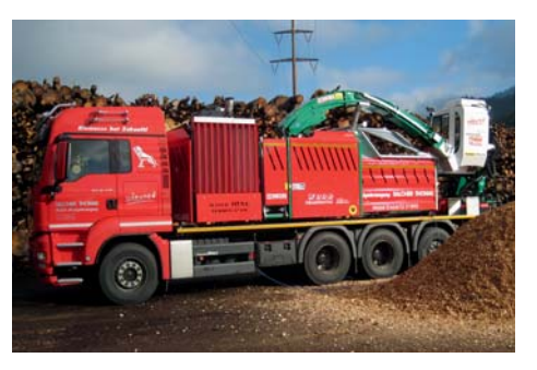
WT 10 XL on truck with diesel engine John Deere 600 HP, chopping machine with slewing ring and 3-m feed conveyor