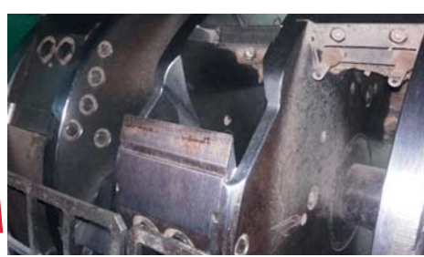
"Multi-tool" chipper rotor