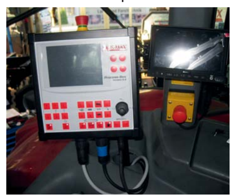
Process box and emergency stop for crane