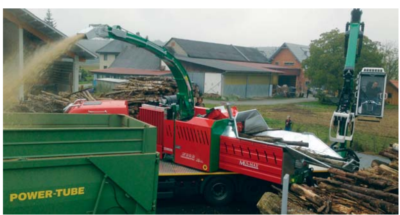
The lifting crane cab provides for excellent visibility at the chopping site.

Either a CAT diesel engine C 15 with 580 HP (15.2-litre displacement) or a CAT engine with 775 HP (18-litre displacement) is used to drive the chopper. Z- or L-timber cranes of the type Epsilon with a range of 10.1 m can be set up.