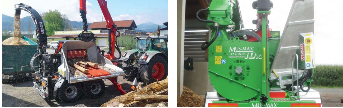
A new, patented spreader blade (swing-tool) transports the wood chip very carefully from the blower, which means that the wood chips are not crushed afterwards.

The market demands high-quality chips with a small amount of fines, which is why a feed blower has been developed whose speed can be adjusted infinitely from 400 to 1000 revolutions. The operator can adjust the blowing distance by up to 20 m.