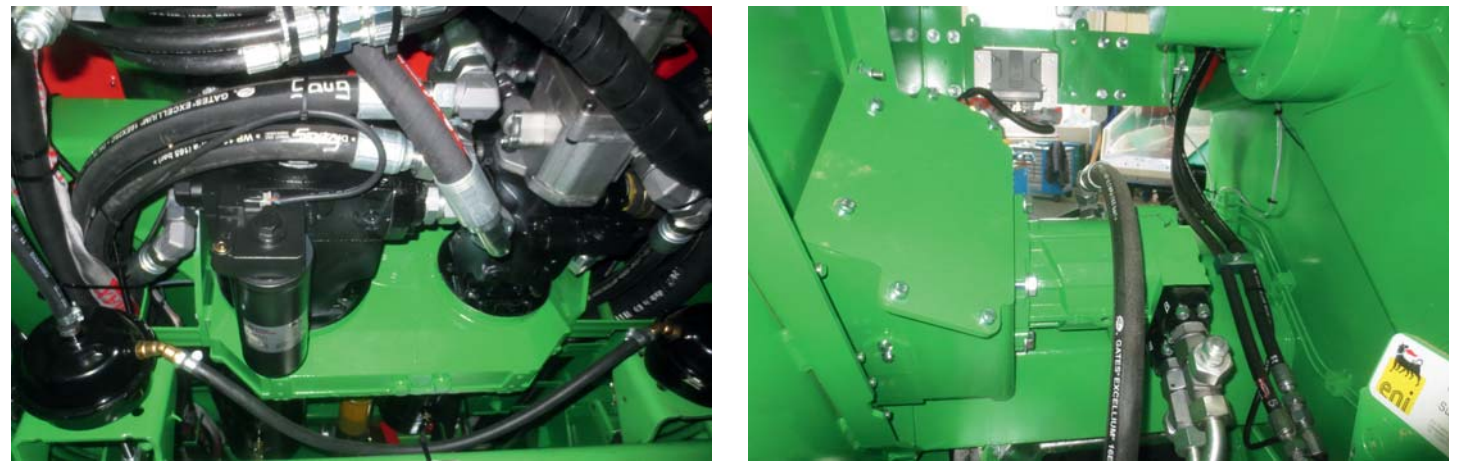
A hydraulic variable displacement pump, which drives a constant oil engine, provides the infinitely variable speed adjustment of the spreader blade.