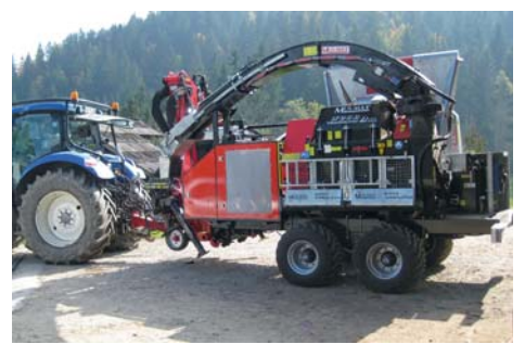
WT 9 XL DS on trailers with a 380 hp Mercedes diesel engine

Allow yourself to be convinced of the flexibility and performance of MUS-MAX and the many decisive benefits of the MUS-MAX drum-type choppers and the optimum price-performance ratio!