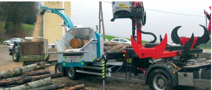
Hacker on saddle vehicle, can be swivelled left and right, with built-up wood splitter