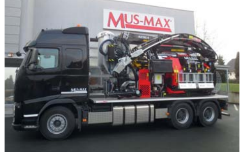
Hack truck WT 9 XL RBV with transmission from the main drive