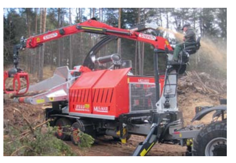
WT 8 XL with 245 HP John Deere engine on underframe

riety of additional pieces of equipment and special machine variants in the process. Special attention is paid to a maximum of convenience for the operation of the chopping machine.