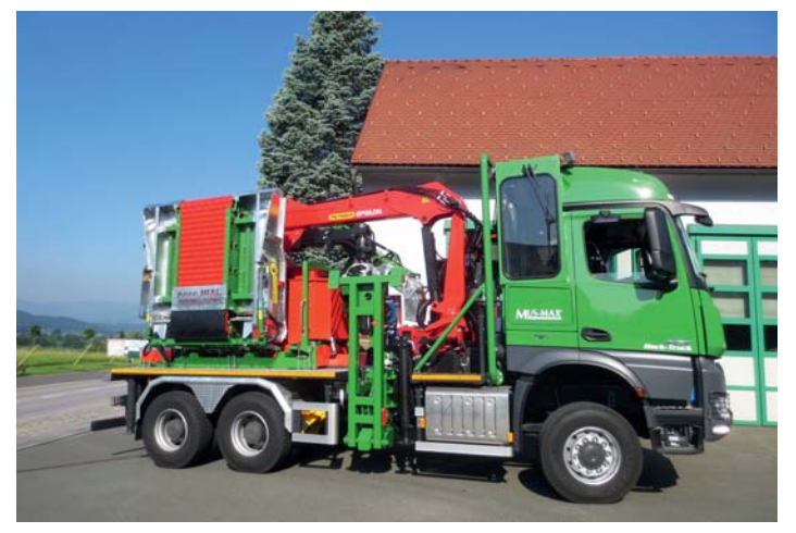
Hack Truck Mercedes WT 10 XL (520 hp) with NMV drive

The truck's engine power can be directly utilised from the NMV drive or RBV "Rögelberg" intermediate gear box.