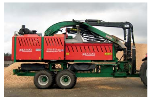
WT 10 XL DLK. WT 10 on underframe with diesel engine CAT C18 700 PS, chopping machine with slewing ring