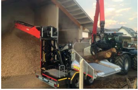
WT 11 for tractor with ascending conveyor and discharge conveyor

Hinged conveyor for all types 2.10 m; 2.40 m or 2.70 m Inclined conveyor WT 8 XL, 9 XL, 10 XL Horizontal conveyor WT 9 XL With length 3.1 m and trough 1.2 m For WT 10 XL diesel engine chopper: Conveyor length 3.60 m and 1.5 m trough WT 11 Z Conveyor with a length of 2.7 m, discharge conveyor Feed nozzle with feed rollers Radio control – chopping functions Radio control – ejector Swivel drawbar Underframe with steering axles Transfer truck with chopper set-up and many more