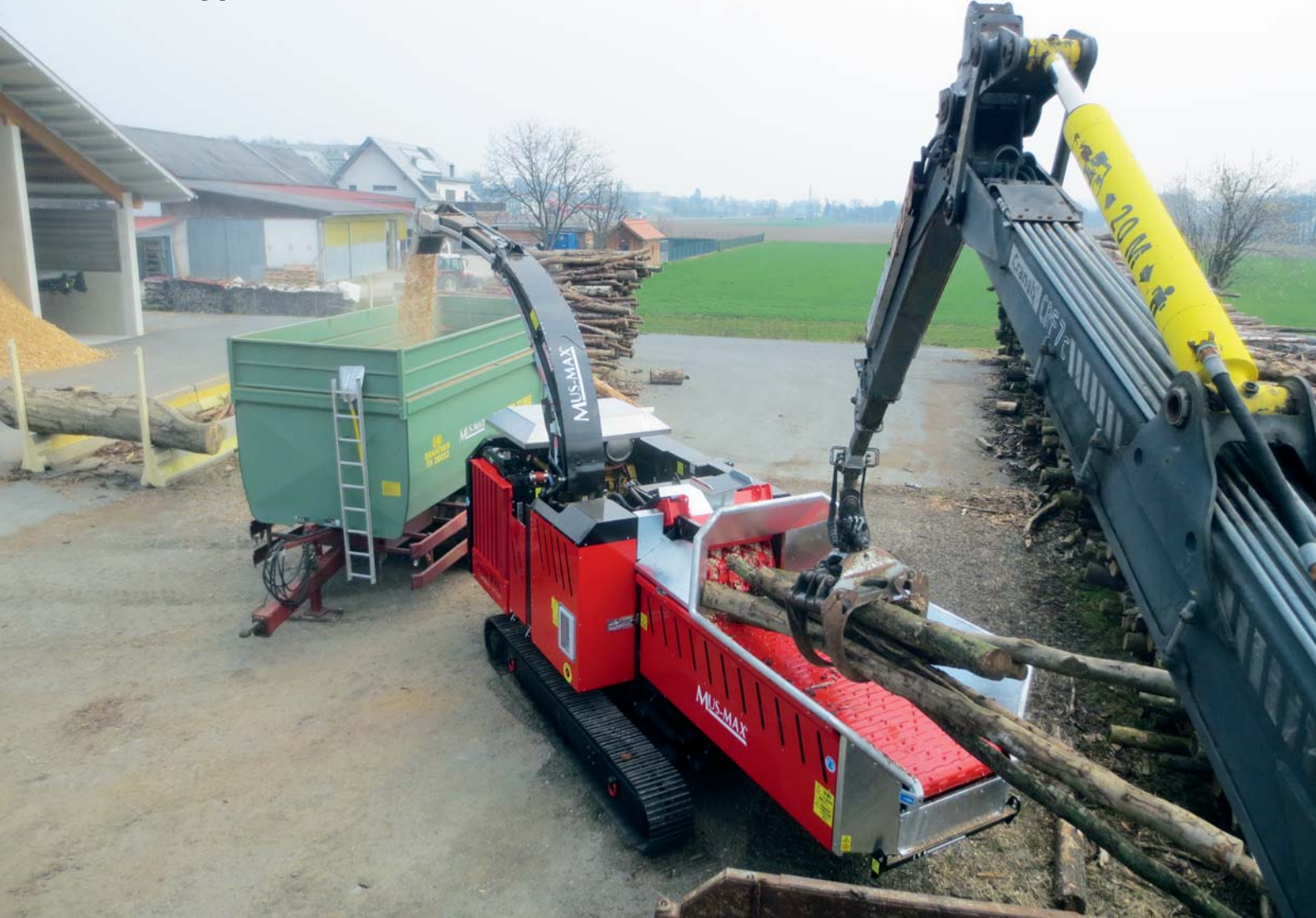
Wood Terminator 9 XL DLK wood chopper on a crawler chassis for Japan. Operation from the excavator by radio control.