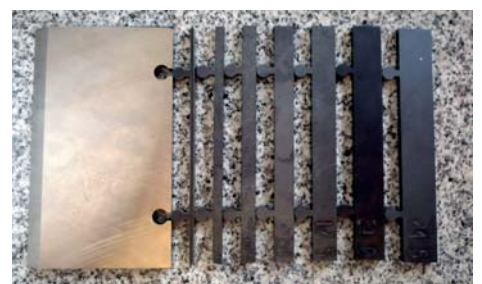
Blades with extension plates