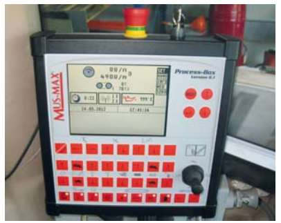
New! Control panel with colour display