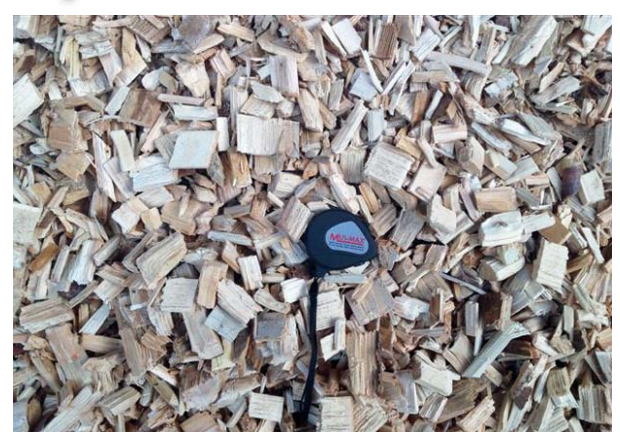
Top wood chips P16S-P31S.

The WT 10 XL DLK longitudinal chopping machines have a feed conveyor with a length of 3.1 m and a hinged extension nozzle with a length of 1.1 m. The total length of the feed conveyor and the extension nozzle is 4.2 m, and it provides for great advantages for the feeding of long timber and treetops.