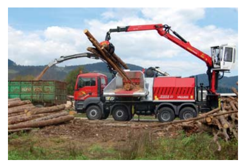
WT 11 on 4-axle truck MAN TGS 41/440 CAT diesel engine 775 HP