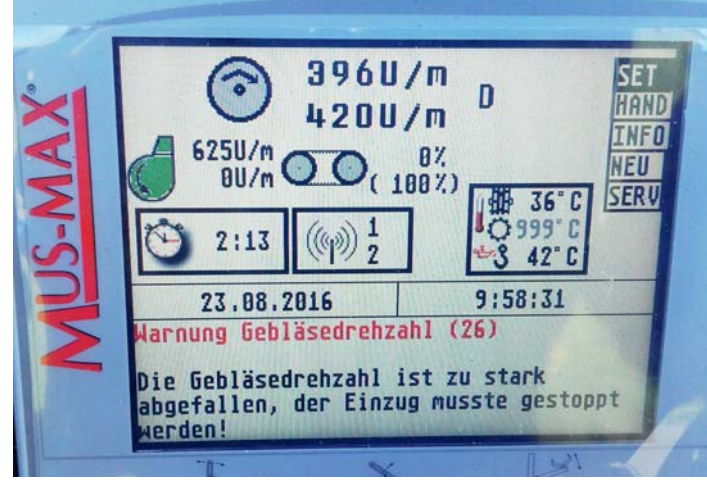
In the cockpit on the control panel, the spreader blade speed is always visible on the display. The speed can be adjusted with a movement of the hand in a few seconds.

The modern, enlarged colour display can be read easily in any weather. Easy adjustment from fine chips to coarse chips, as well as of speed mode. And the feed belt speed, hydraulic oil level, hydraulic pressure, hydraulic oil temperature, important monitoring functions of the diesel engine, and much more can also be read.