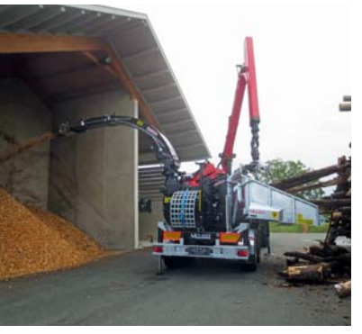
Top throw width = neat, chunky wood chips