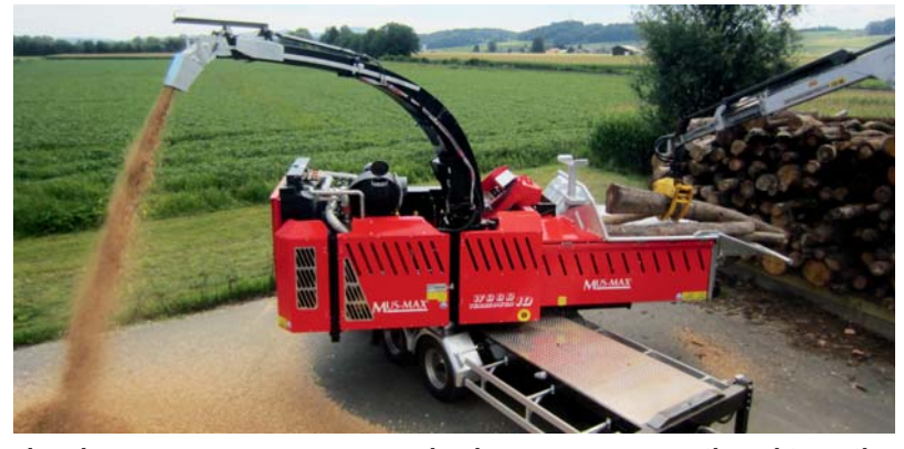
The chopper WT 10 XL DLK can also be set up on a trailer. This trailer has robust, hydraulic support feet. The chopping vehicle can be towed with a tractor or a truck.