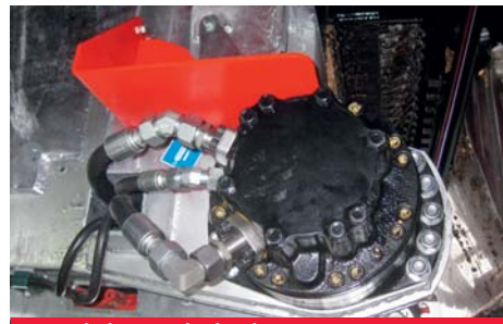
Top radial piston hydraulic motor